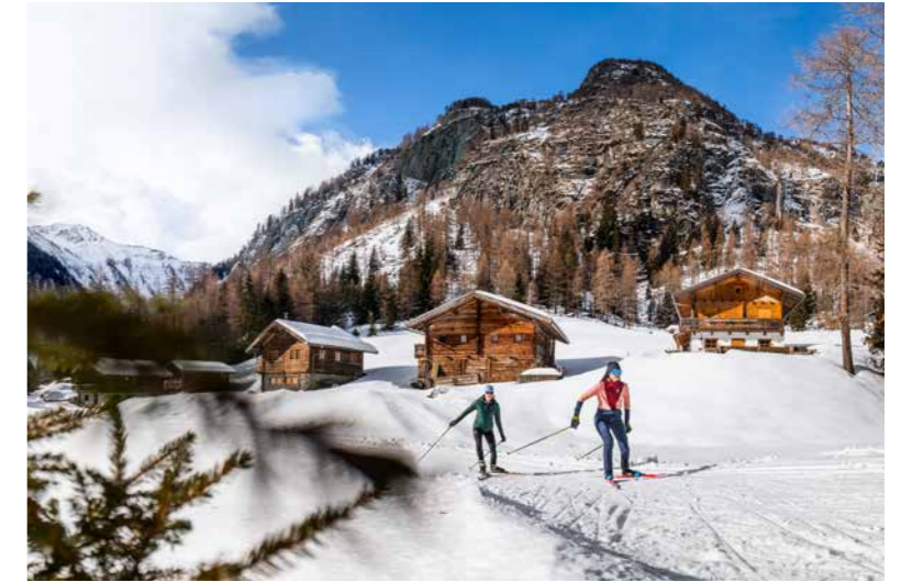
Passing rustic huts along the route in the quiet Virgental

The view of the icy giants of Mauerental is unique and invites you to enjoy various circuits on the extensive fields at the end of the valley. It is even possible to go cross-country skiing in the evenings in Prägraten – on the illuminated circuit Blusenrunde from 16.00 to 21.00.