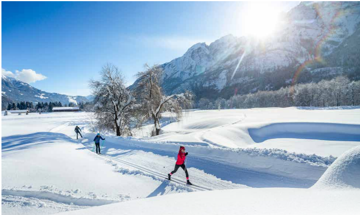
The idyllic trails along the Lienz valley floor, with the Lienz Dolomites as a backdrop.